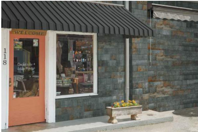
AV343 ▶ Acid Wash 6 x 24