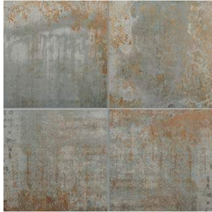
AV342 ▶ Steel Gaze