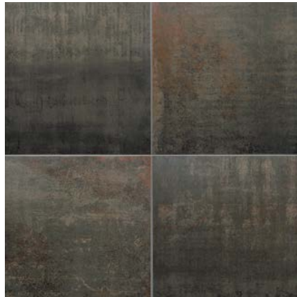
AV345 ▶ Melting Point