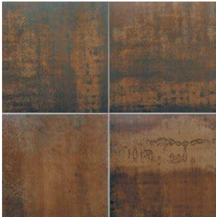
AV344 ▶ Copper Core