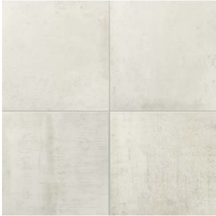
AV341 ▶ White Hot