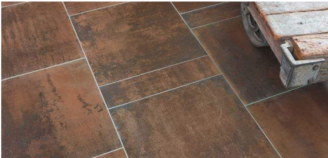
AV344 ▶ Copper Core 6 x 24 and 24 x 24