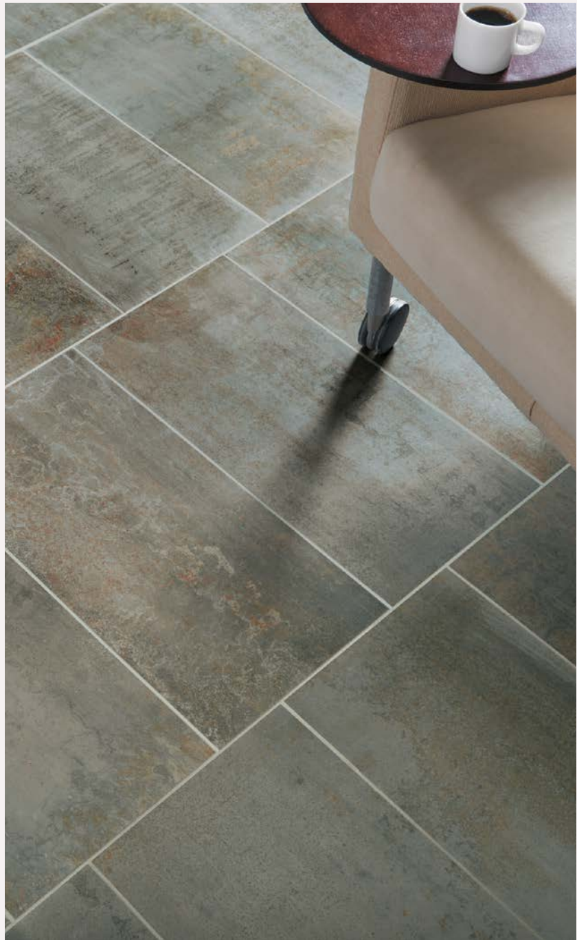
AV342 ▶ Steel Gaze 12 x 24