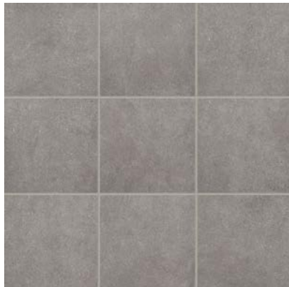
AV214 ▶ Gallery Grey