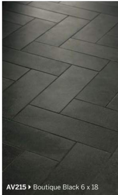
AV215 ▶ Boutique Black 6 x 18

Regular cleaning is the best way to keep Main Street tile looking good for years to come. Use clean, hot water (combined with a household cleaner for more aggressive cleaning). Rinse thoroughly and dry with a soft cloth. No waxes are needed.