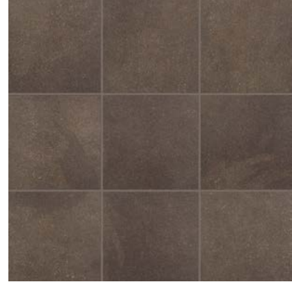
AV213 ▶ Bistro Brown