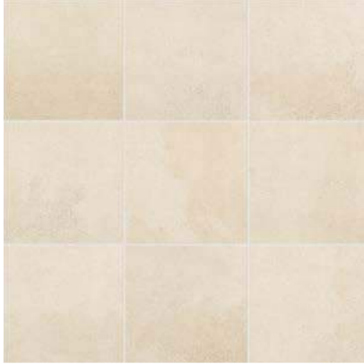
AV211 ▶ Cinema Champagne