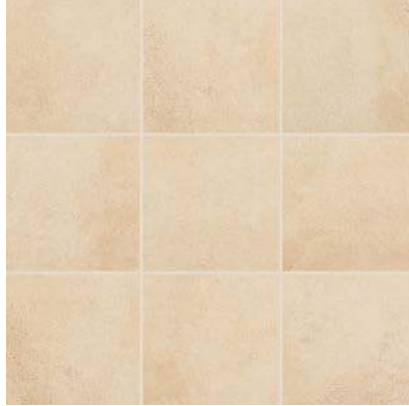
AV212 ▶ Café Caramel