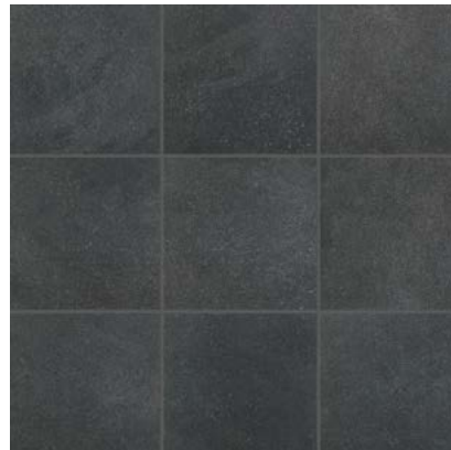
AV215 ▶ Boutique Black