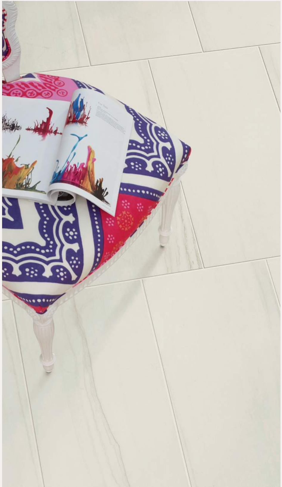
AV302 ▶ Luna 18 x 36 UPS