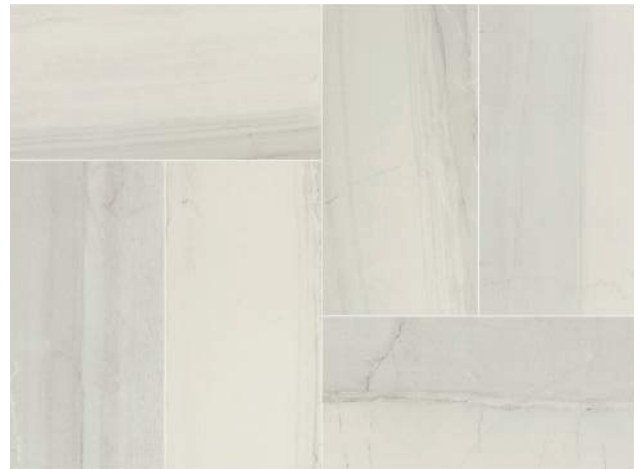
AV302 ▶ Luna HON