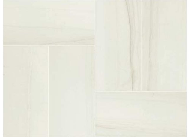
AV301 ▶ Juno HON