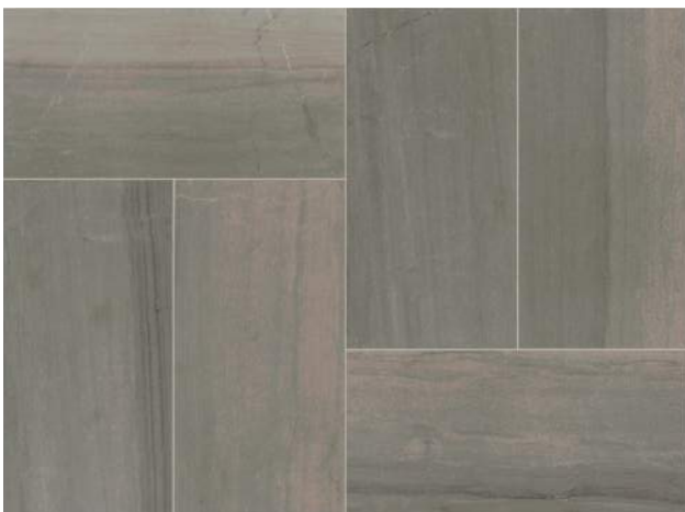
AV305 ▶ Apollo HON