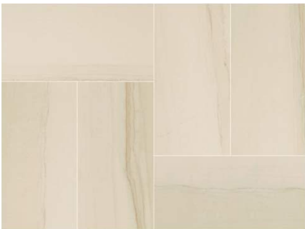
AV303 ▶ Kosmos UPS