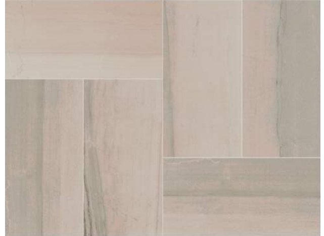
AV304 ▶ Gemini HON