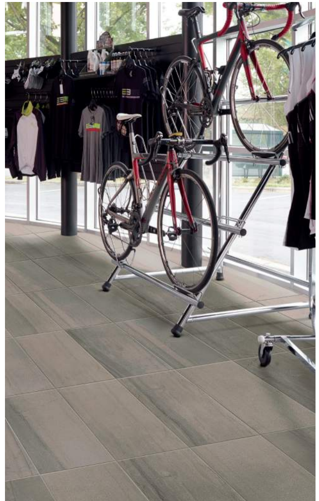
AV305 ▶ Apollo 12 x 24 HON