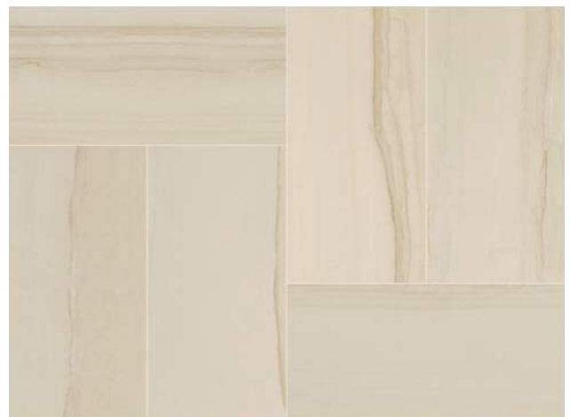
AV303 ▶ Kosmos HON