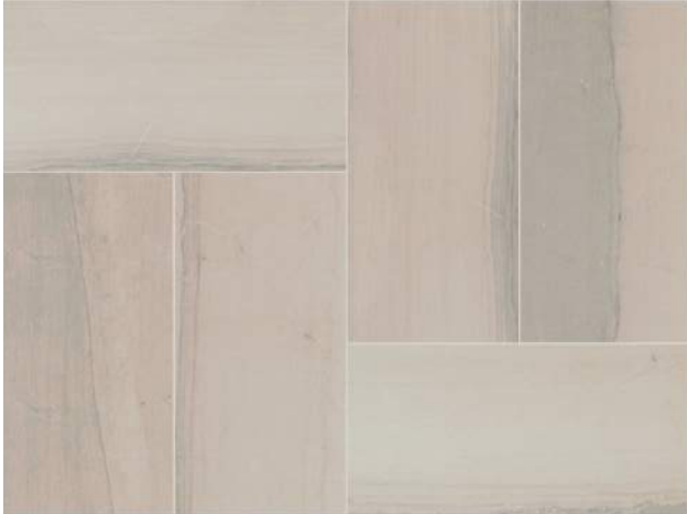
AV304 ▶ Gemini UPS