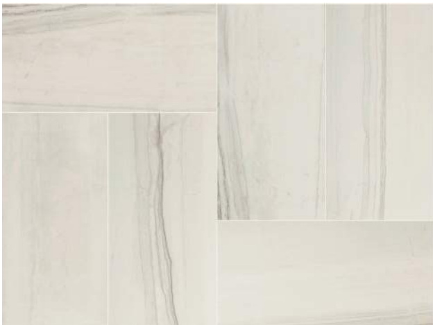
AV302 ▶ Luna UPS