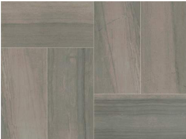
AV305 ▶ Apollo UPS