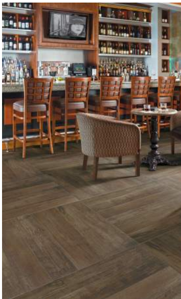
AV285 ▶ Bankroll 6 x 36 UPS