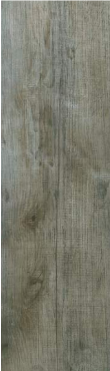
AV284 ▶ Silver Screen