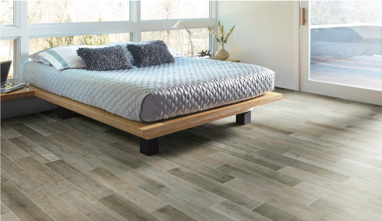
AV281 ▶ Sidecar 6 x 36 UPS