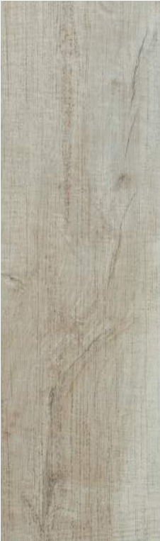
AV281 ▶ Sidecar