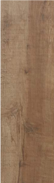
AV283 ▶ Sweet Georgia Brown