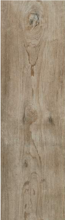
AV282 ▶ Zoot Suit