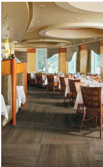
AV285 ▶ Bankroll 6 x 36 UPS