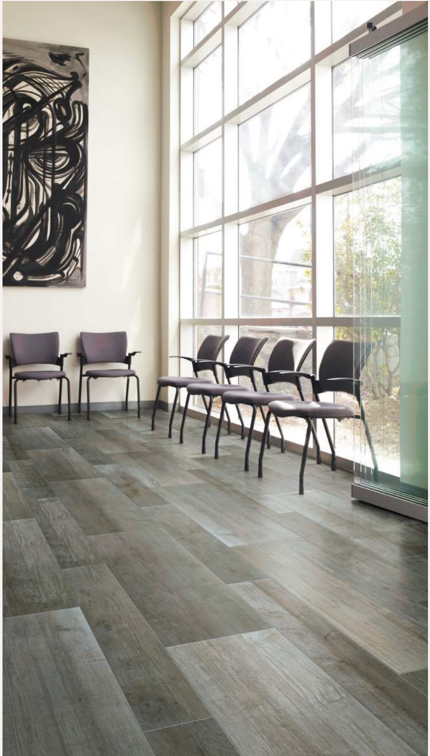
AV284 ▶ Silver Screen 6 x 36 and 12 x 36 UPS