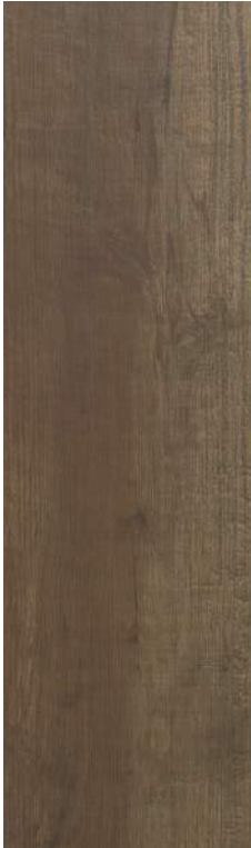
AV285 ▶ Bank Roll