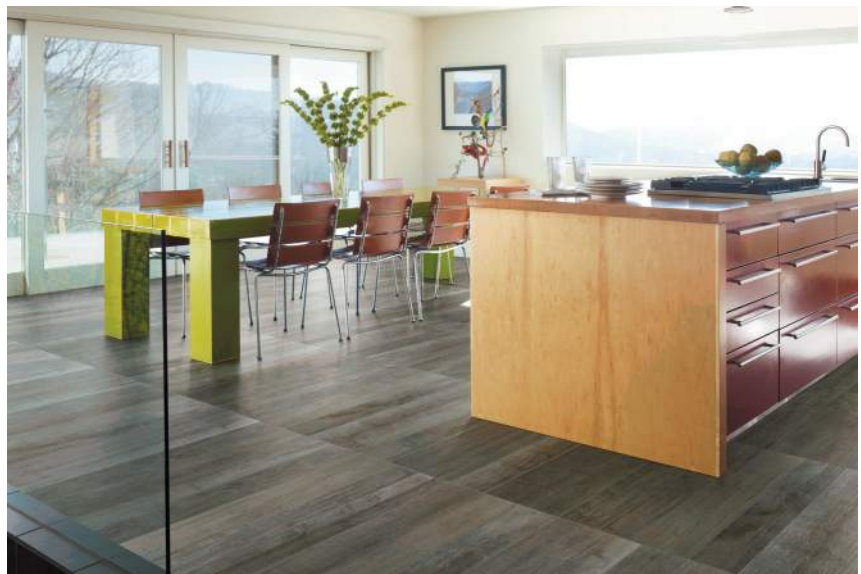
AV284 ▶ Silver Screen 6 x 36 and 12 x 36 UPS

This porcelain tile product is produced with a V3 variation. Inspect the product upon delivery and for best results, blend tile from several cartons during installation.