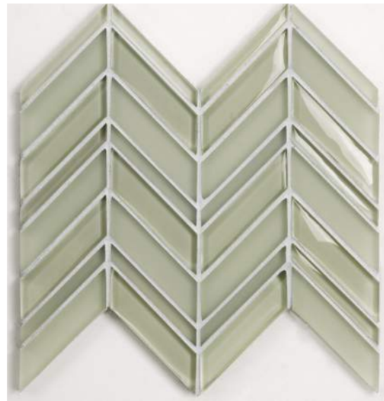
COUPLET - SOFT GREEN