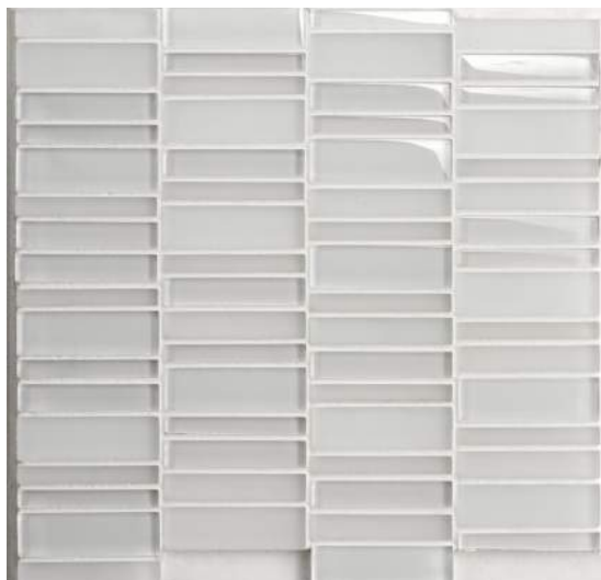
CANTO - CASPER WHITE