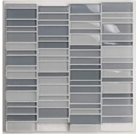
CANTO - COOL GREY BLEND