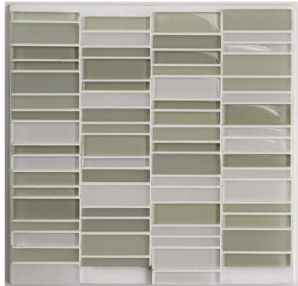
CANTO - SOFT GREEN BLEND