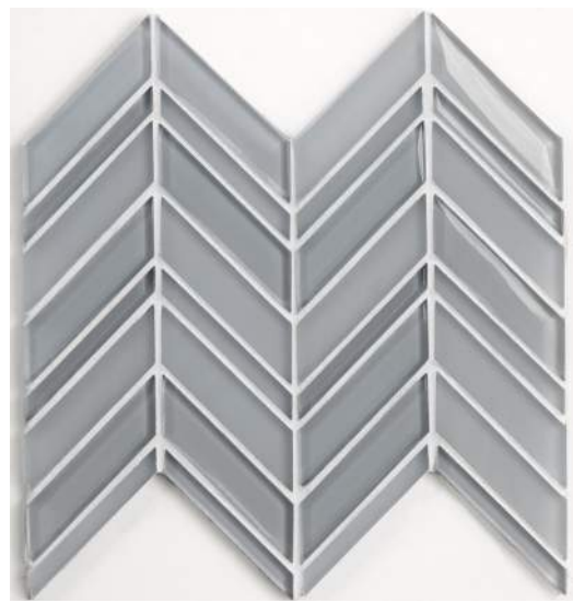
COUPLET - SOFT BLUE