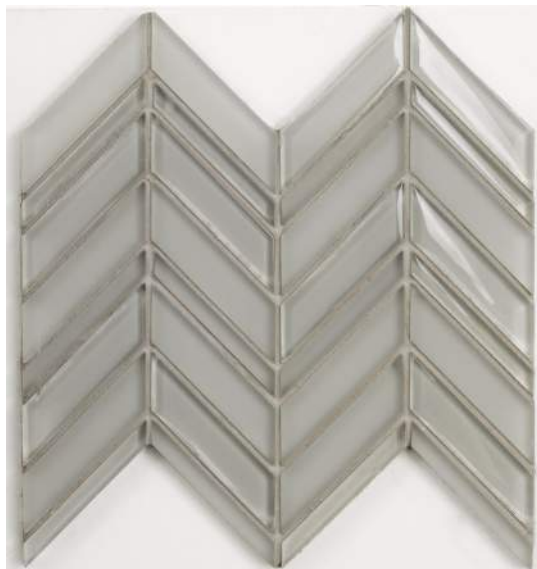
COUPLET - WARM WHITE