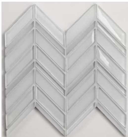
COUPLET - CASPER WHITE