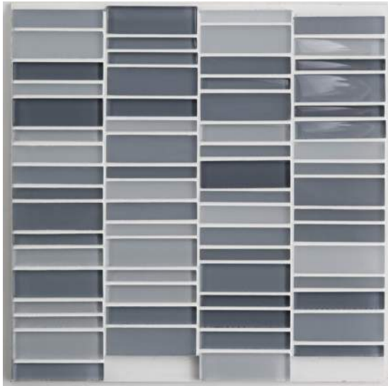
CANTO - SOFT BLUE BLEND