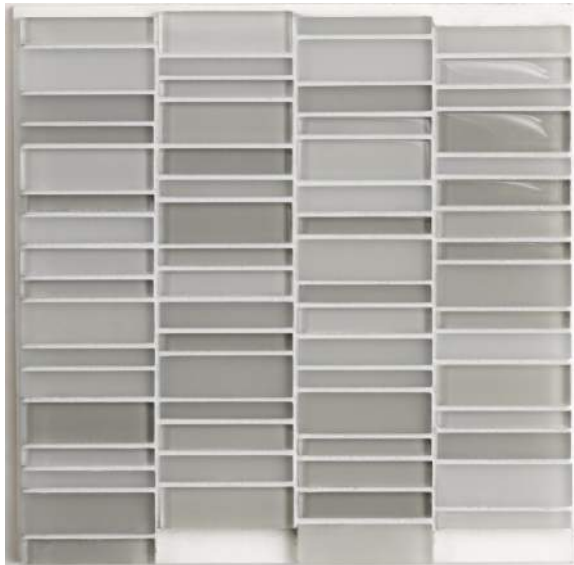
CANTO - WARM WHITE BLEND