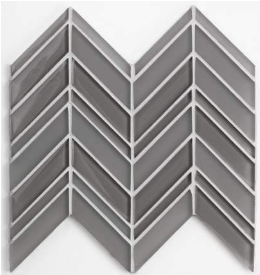
COUPLET - WARM GREY