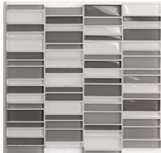
CANTO - WARM GREY